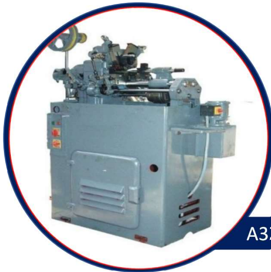
A32 Semi Auto Lathe