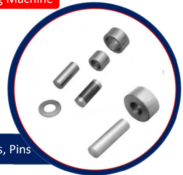
Rollers, Bushes, Pins