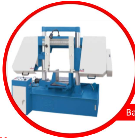
Bandsaw Cutting Machine